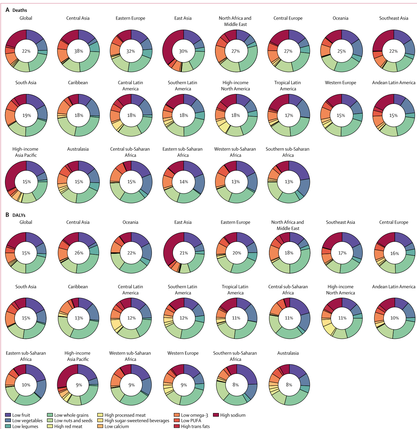
Figure 4: Age-standardised proportions of deaths and DALYs attributable to individual dietary risks at the global and regional level in 2017 DALYs=disability-adjusted life-years.

The lowest burden of exposure to dietary risk was observed in high SDI countries (139 [129–148] deaths per 100 000 population and 3032 [2802–3265] DALYs per 100 000 population). Low-middle SDI had the highest age-standardised rates of diet-related deaths and DALYs